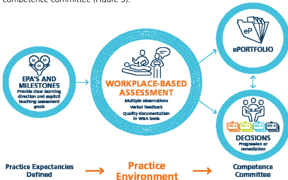
Figure 3. Situating WBA in CBD assessment framework

In CBD, supervisors make use of authentic clinical oversight to engage in the workplace-based assessment (WBA) of each resident's performance. WBA should be feasible; put simply, it involves documenting the verbal feedback that many supervisors already give to their residents. The goals of WBA are to provide specific feedback for trainee development as well as sufficient practice performance data to inform the EPA achievement decisions of the competence committee (Figure 3).